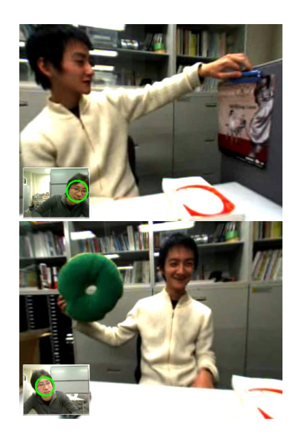
Figure 2. Screen captures from the prototype.

For a prototype, we implemented a video communication system composed of a client laptop that has a webcam and a fisheye camera connected to a PC in a remote place. The webcam of the laptop is used for head tracking, and the fisheye camera is used as a digital PTZ camera. We chose a fisheye camera instead of a regular PTZ camera to avoid control latency.